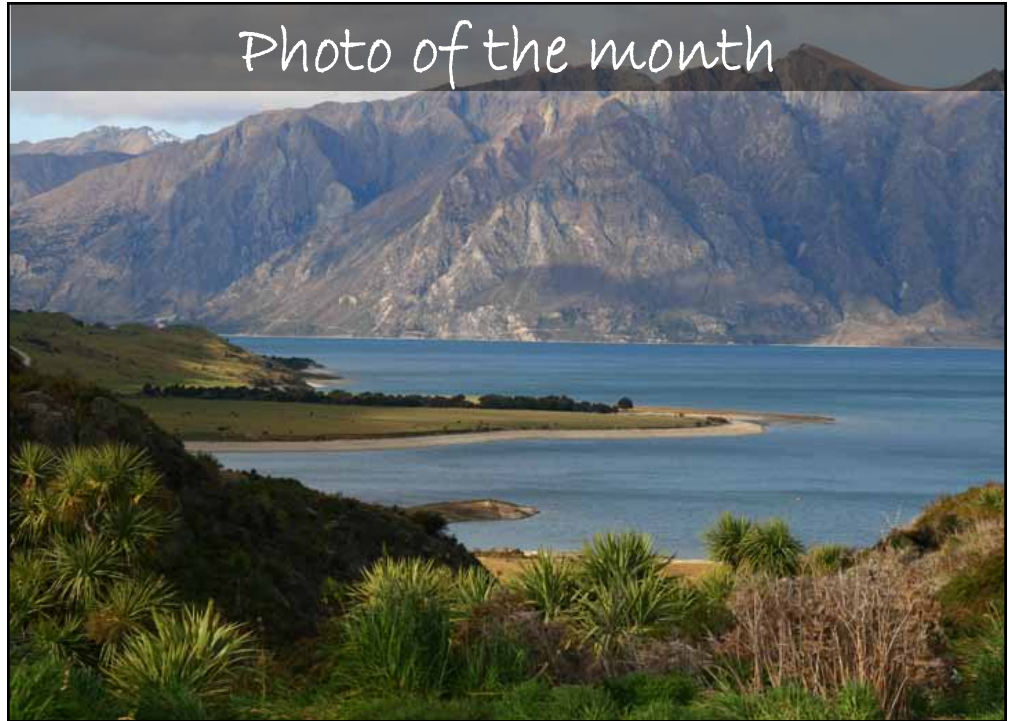
A beautiful lookout point in New Zealand, while on our way to Wanaka.