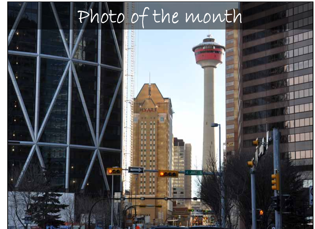
"After MSBCA SGM, I was walking towards James Short parkade and took this picture to show Calgary to the world."

Send your questions, comments or articles to: editor@msbca.ca