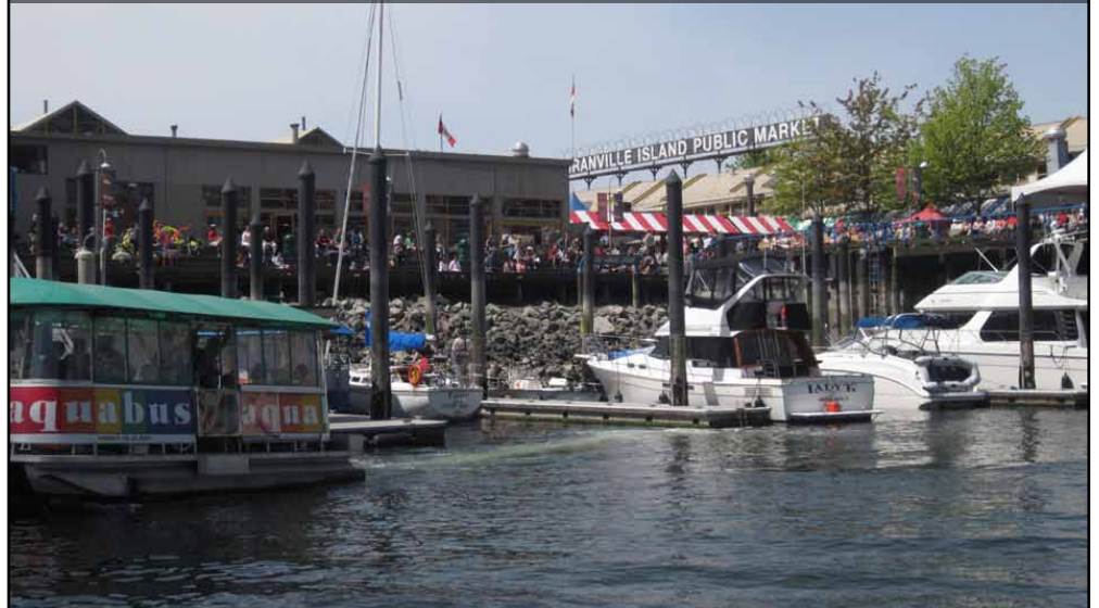
A ride on the Aqua Bus to Granville Island Public Market in Vancouver BC on beautiful, sunny afternoon. May 2010.