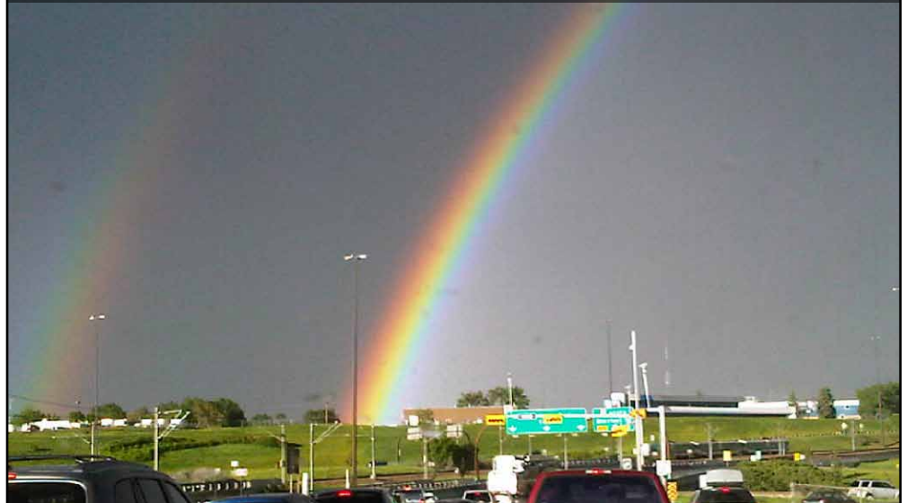
A beautiful, full, spectrum, rainbow. A second, faint rainbow can be seen as well. Taken after an afternoon shower. Along Memorial Trail.