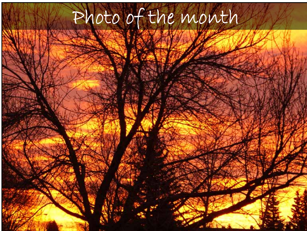
"Picture of the sunset captured from the front of our house in Okotoks, Alberta."