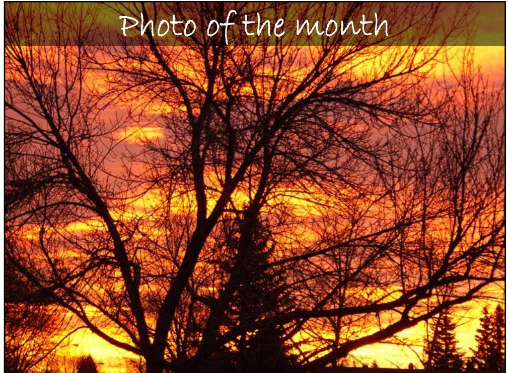
"Picture of the sunset captured from the front of our house in Okotoks, Alberta."

Send your questions, comments or articles to: editor@msbca.ca